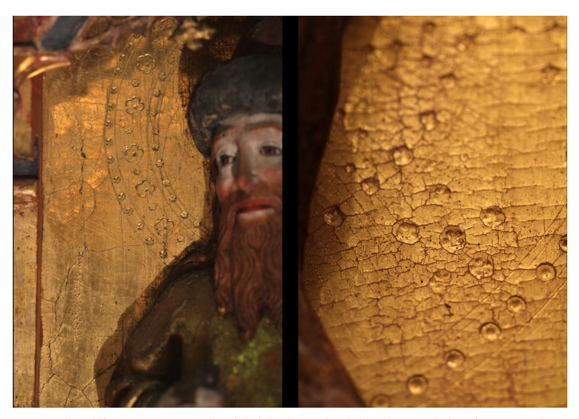
Fig. 4 a-b. Different stamps on the gilded back panels: a) Trondenes II (high) Altarpiece: Various rosette-stamps. b) Vardo Altarpiece: Small rosette punch.

creating straight pointed lines.<sup>19</sup> Cogwheels were normal from the second half of the fifteenth century, in Sweden specifically from examples after 1468. Thus, the Norwegian material represents early examples of this technique, where all the early shrines except Fosnes display use of a cogwheel to imitate rays, evident from the repetitive pattern and the square form of the single points. Bergen St Mary's and Luroy show a special use of the cogwheel (Fig. 3). The rays appear three-dimensional: an effect created by rolling the cogwheel back and forth in increasingly closer lines towards the edge of the ray. In addition to this rare pattern, the two shrines also have an identical decorative punching and gilding poliments, indicating a workshop connection. All the decorative aspects discussed in this section, from ground to ornamentation, indicates that this workshop was active 1470–1480, twenty years earlier than the stylistic dating of Bergen St Mary's given by Engelstad in 1936.<sup>20</sup>