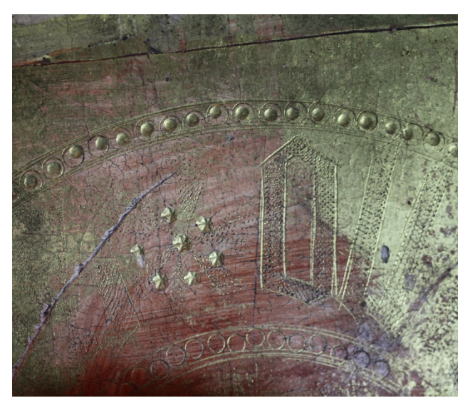
Fig. 2. Detail back panel shrine, Nesna Altarpiece. A thin wash of poliment is visible through the burnished gilding. The gold is decorated with punch work consisting of dot, circle and star punches, and incised lines in the saints' names.

The shrines of the early altarpieces have poliments of a specific character. It consists of a thin wash, applied in one layer with streaky brush work. The colours range from bright pink, as seen in Vardø, Nesna, Lurøy and Bergen St Mary's to dark red, visible on Holmedal, Trondenes IV and Fosnes (Fig. 2). The thin wash is more reminiscent of an intermediate layer than a conventional poliment, the main purpose of which was to give colour and secondarily to act as a 'cushion' during the burnishing of the metal layer. However, burnishing – and burnished gilding – does not necessarily require cushioning and colouring poliments: in the twelfth- to the fourteenth centuries so-called groundgilding was used in Northern Europe, where the gold was applied directly