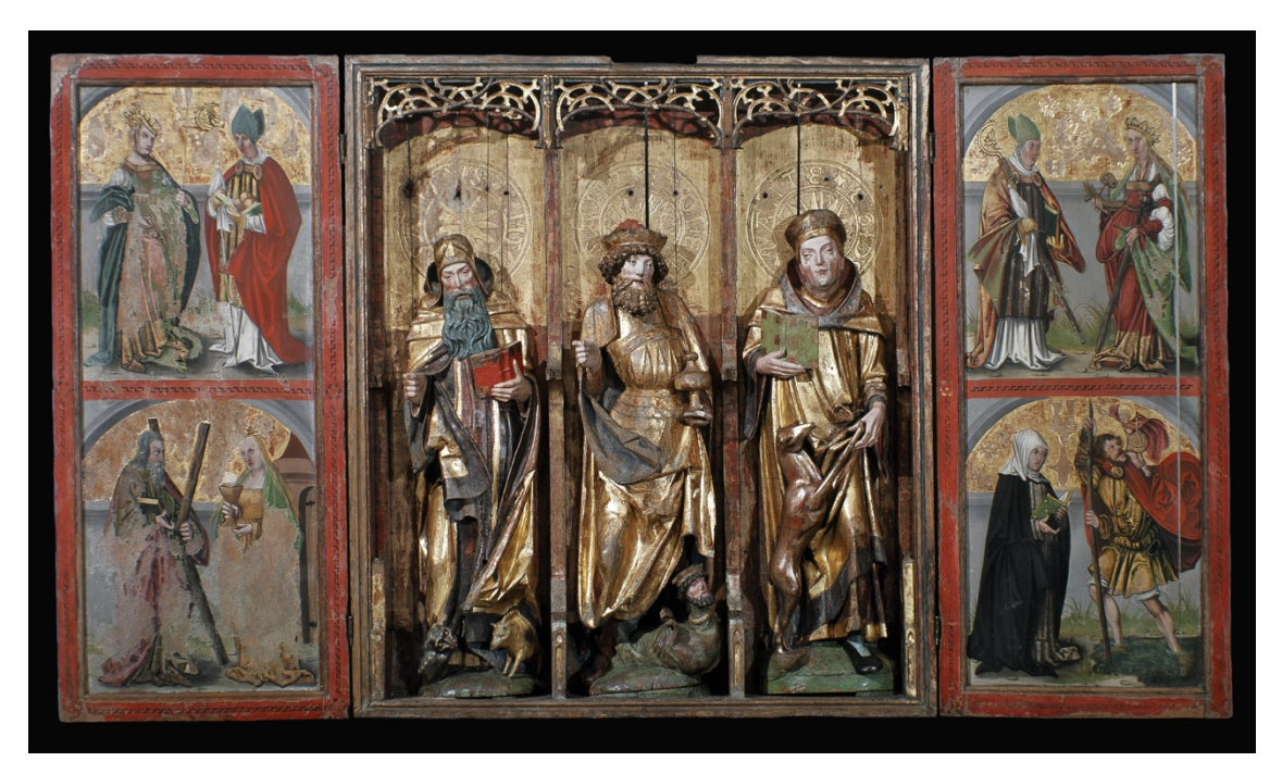
Fig. 1. Kvæfjord I Altarpiece. 130 x 113 x 16 cm. Inv. 3215, Museum of Cultural History, Oslo (MCH).

The collected data, gained from minute fragments or pristine surfaces, will not only serve as a valuable source of information on medieval gilding, decorative painting and application practices on an important portion of the altarpieces which often get overlooked. It will also be a prism to explore aspects such as polychromy as an agent of symbolic hierarchies and the relation between form and colour, as well as questions of dating.