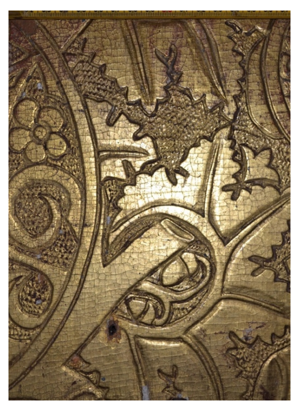
Fig. 6 Detail, back panel shrine, Vevring altarpiece. To imitate luxurious textiles, a texture in the form of a subtractive relief was carved into the ground, such as this popular oak branch pattern.

Carved relief with zigzag hazzling is claimed to have arisen in Lubeck at the end of the 1470s, in the workshop milieu around Bernt Notke.<sup>29</sup> However, the first known example of the technique is found in Ulm in South Germany, on the Sterzinger Altarpiece of Hans Multscher from 1456.30 Although a few other early examples from Tyrol and Lubeck also employed this technique, 31 it was not until the 1470s and 1480s that the technique became more frequently used in the whole of Germany.<sup>32</sup> It quickly replaced other methods of producing textile patterns by manipulating the ground.<sup>33</sup> From the sixteenth century onwards, this 'Allerwelts-Strukturiertechnik' was employed in both northern and southern Germany to depict all kinds of textures, such as on the back panels in the shrines.<sup>34</sup> Before this period, this technique was mainly used on the clothing of the