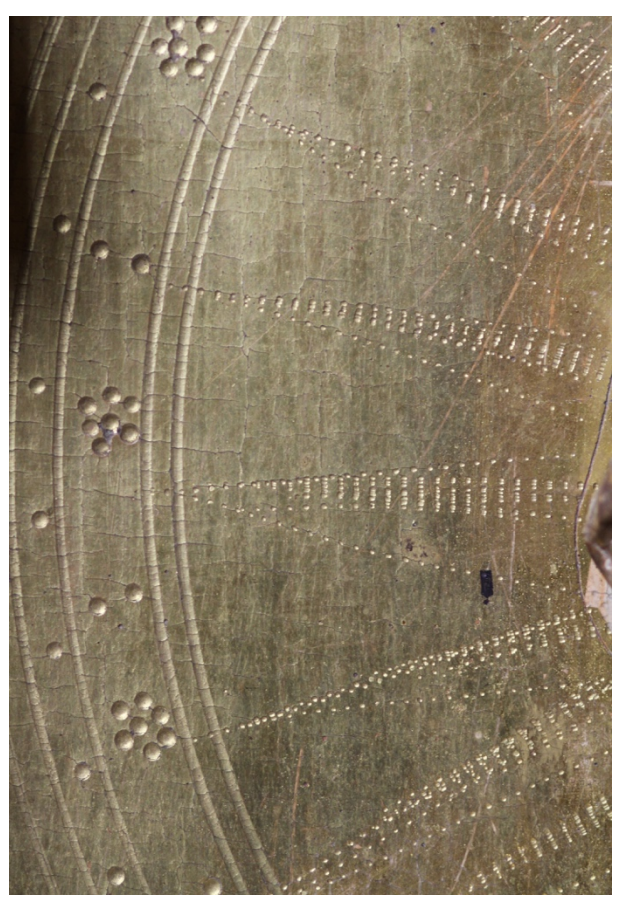
Fig. 3. Detail of back panel of shrine, St Mary's Bergen. The punch work displays the common design of simple dot-stamps forming rosettes and lines. The incised rays appear three-dimensional: an effect created by rolling the cogwheel in increaseingly closer lines towards the edge of the ray.

Usually several circles were indented, forming narrow bands along the edges of the haloes. These outlines served as a base for punching. Punching was the process of placing a metal stamp perpendicular to the object's surface and tapping with a hammer in order to imprint a small pattern or design onto the surface. The skill of punching lies within achieving a consistent depth and placement of the indentation, without puncturing the metal. Providing that the chalk ground was still flexible, the punch should compress it without breaking the gold leaf. This skill was not always easily achieved: the patterns in Norway often display uneven repetitions and depths of the punches, frequently breaking the thin metal leaves.