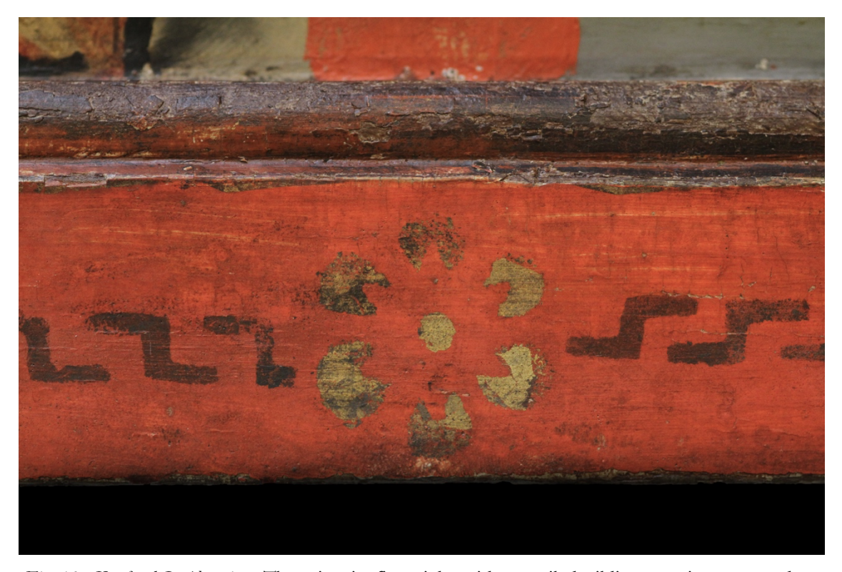
Fig. 10. Kvæfjord I Altarpiece. The wing in first sight with stenciled gilding creating a meander pattern of silver and rosettes of part gold. Photo © Kristin Kausland.

the wings, the same painter must also have painted the wing panels of both altarpieces, as clearly revealed by similarities in style and technique. Thus, the use of similar stencil patterns in all likelihood relates to common workshops, and not a template that spread through influences and migration of craftsmen.