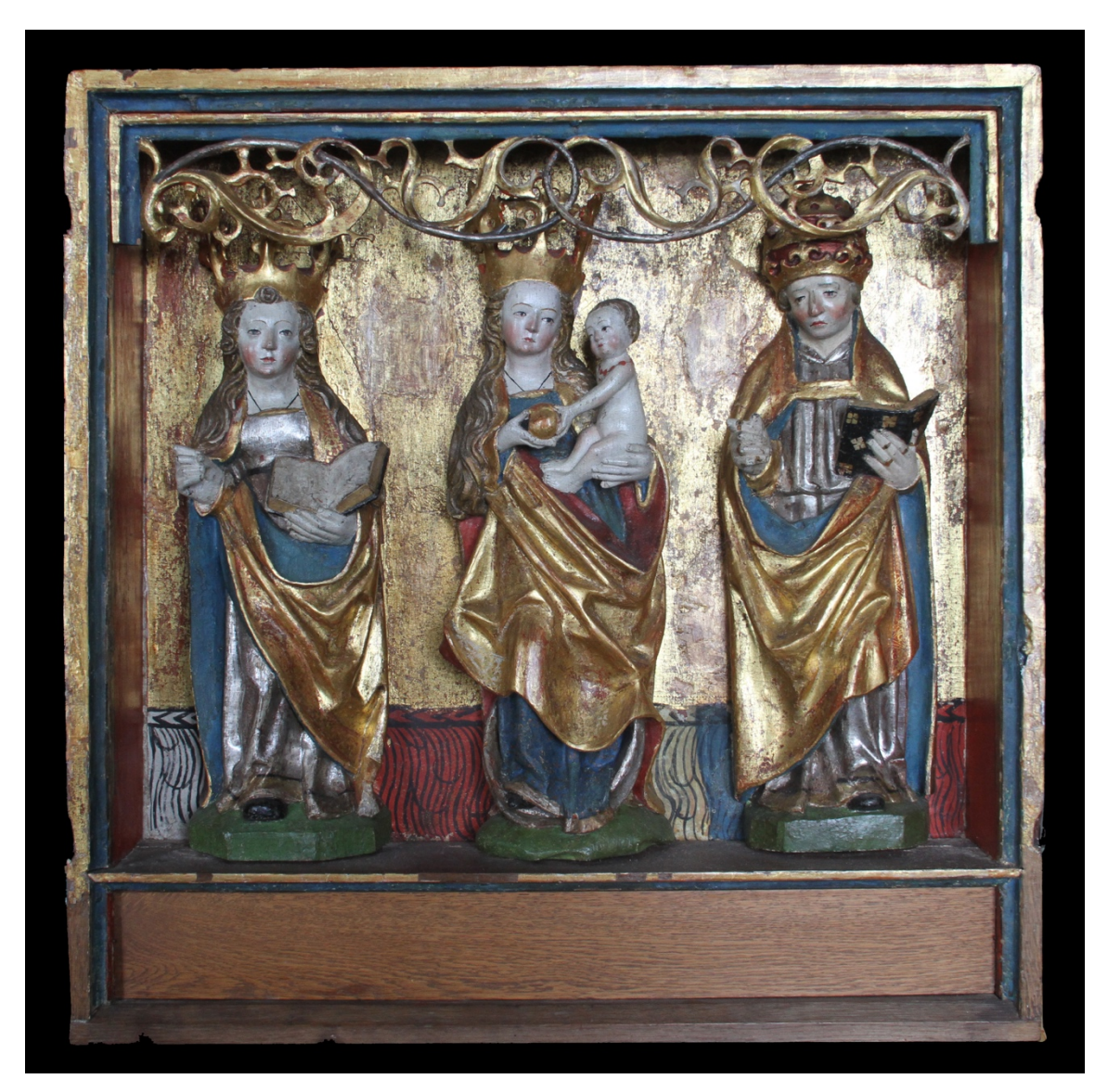
Fig. 5. Hamre altarpiece. 57 x 57 x 11. Located in Hamre church, Askøy.