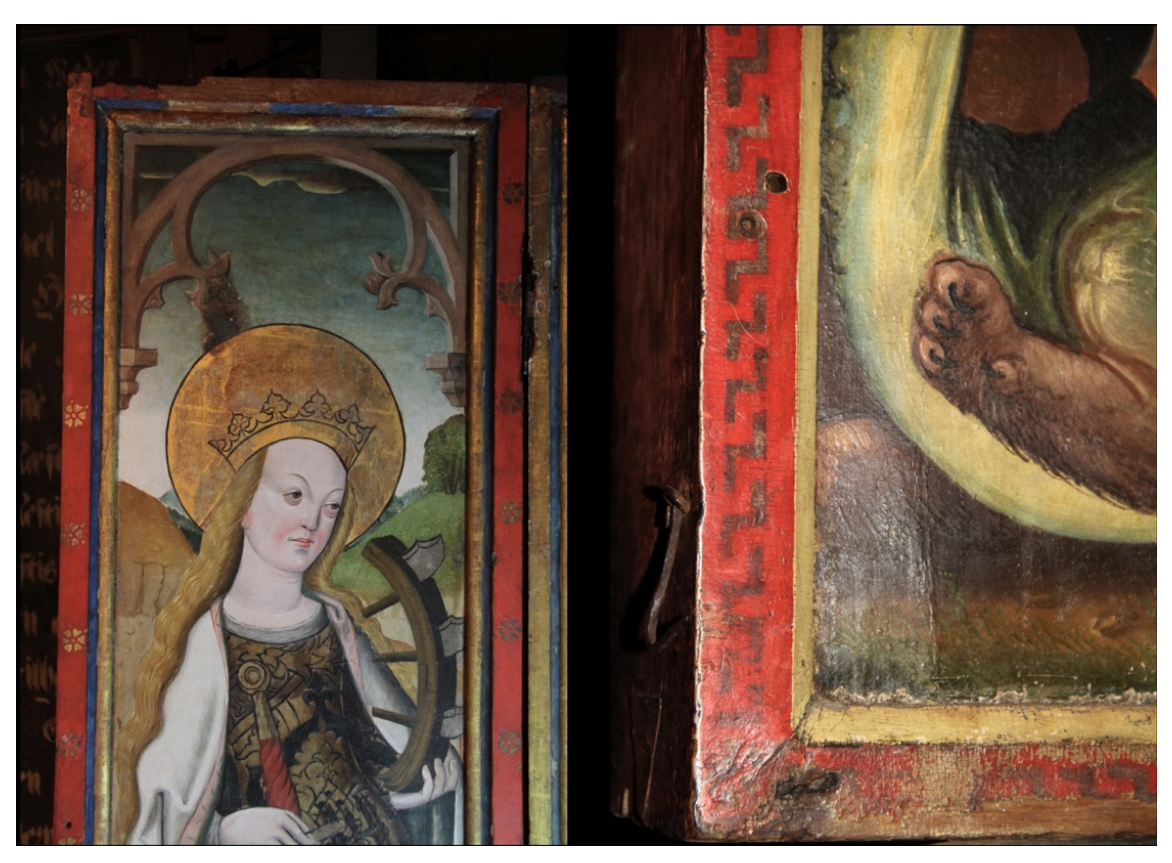
Fig. 7a-b a) Trondenes IV Altarpiece. The frame mouldings of the wings in first sight: red front, blue cavetto and gilded ovolo. b) Uggdal Altarpiece. The frame mouldings of the wings in second sight: red front with yellow bevel.