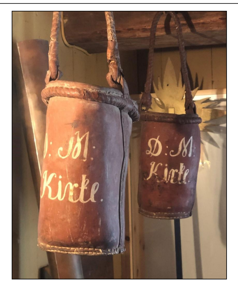
Fig. 2. Water buckets used for firefighting described by Suikkari, can be seen in Norway today, although not in use. Pictured are 19th century water buckets made of canvas, belonging to Austre Moland church, Agder.