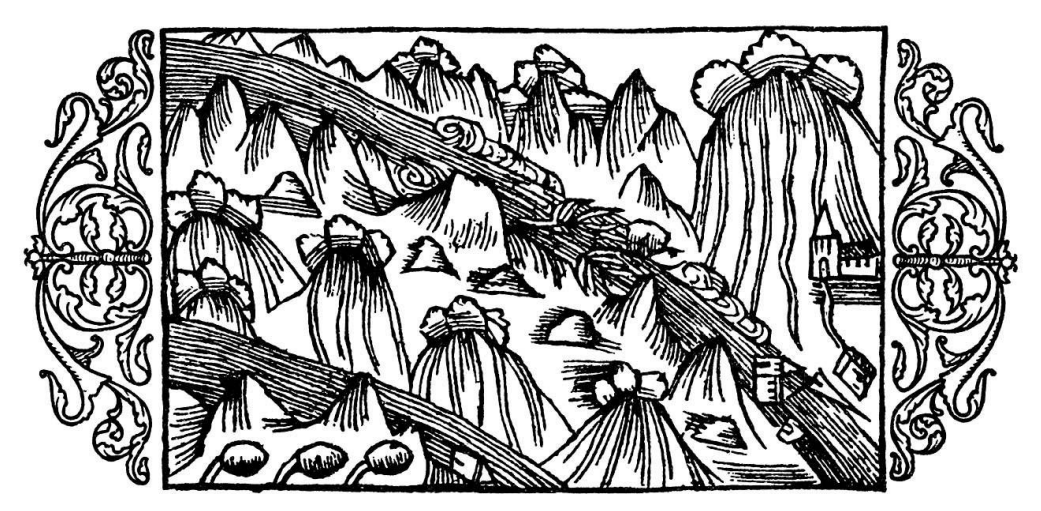
Fig. 3. Illustrations by Olaus Magnus from the 16th century depict daily life in the Nordic countries. The woodcut" On the flooding of streams" from 1555 shows the two Swedish rivers Indalsälven (top) and Ljungan (below). It is spring and the annual flood from the melting snow in the mountains destroy houses, a church and trees [58]

from the ancient adaptation measures from China and Japan, as a large spectrum of the measures used then are still in use today. The same lessons can be learned from combining Ancient "Blue-Green" principles and modern "Sponge city" approaches. This presents the case of the coastal city of Ningbo (one of the oldest cities in China, going back to B.C. 6300), with a long history of floods since ancient times. Reviving traditional approaches to urban water management offers the possibility to control and maintain flood risk at an acceptable level without any constraints on urban growth in China; same approach can be transferred and applied to other coastal cities in the world that experience a rapid urban development [60].