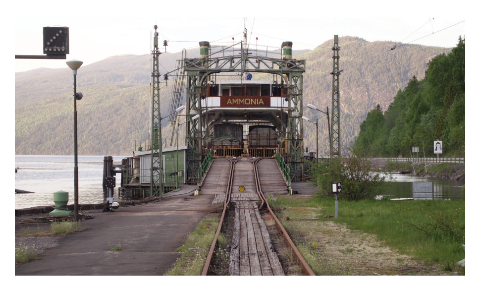
Fig. 3. The ferry "Ammonia" (1929, protected 2009) is an important link between Notodden and Rjukan, two neighboring industrial towns based on easy available hydroelectric resources. They were assigned status as Word Heritage Sites in 2015.

designated as European simply because they are located there. According to Soyez, it is essential to bring forward a broader perspective on transnational issues (Soyez 2009, p. 49). His main criticism, however, concerns the way the industrial heritage is presented: The dark sides of European industrialisation processes are seldom properly represented, which result in industrial heritage being pictured as 'sanitized heritage'. The point he particularly calls attention to is the role that industrial enterprises have played during wars. There is no focus on the 'disquieting realities of war and occupation or the ordeals of prisoners of war or forced labour'. According to Soyez, there is an abundance of industrial sites that will evoke dark memories across Europe. He uses this as an illustration of the dissonance that much heritage holds. In his article, Soyez identifies alternative ways of thinking about and representing industry in the heritage field (Soyez 2009, p. 44).