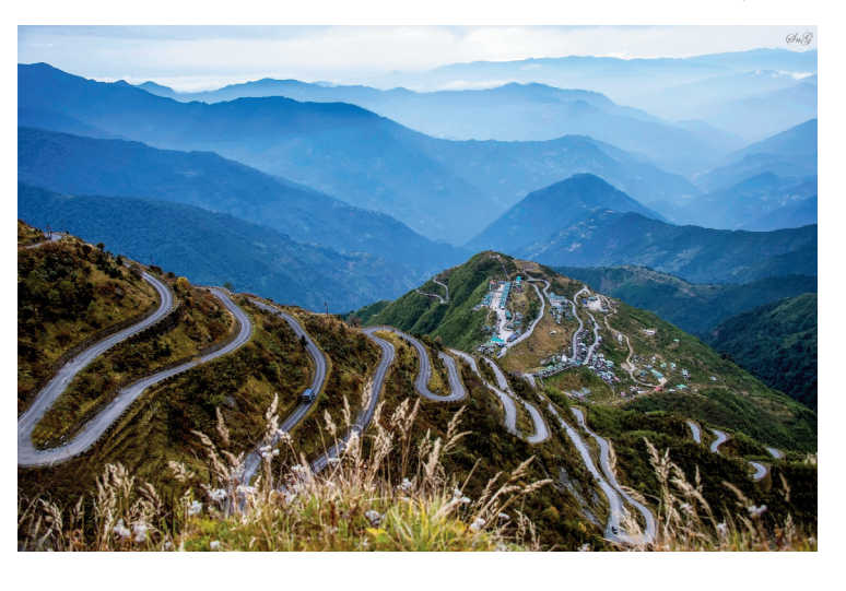
Fig. 2. A section of the Silk Road: steep, curved stretches of road in Zuluk, Sikkim on the Silk Route from India to China (photo: Soumya N. Ghosh. Used with permission).

or excluded from the inscription. As well as these variations, there are changes to the routes over the centuries and also seasonal differences in routes due to river swells and other climatic phenomena (Williams 2012). This has led to a network of roads that fluctuate in their usage. Consequently, there is not necessarily always a single defining route that can be used to represent the site.