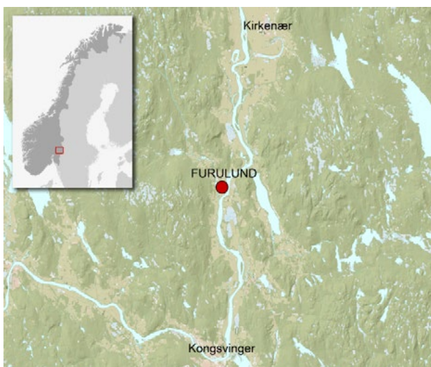
Figure 1: The abandoned medieval church site of Furulund is situated along the River Glomma, between the town of Kongsvinger and the village of Kirkenær in Hedmark County.

The probable graveyard area was estimated to be within a 50 x 50m area, encompassing both the area the farmer had set aside as the church location and the area where bones were found ploughed to the surface. To keep costs minimal, transects were used for geochemical sampling to delimit the graveyard. Five transects were established with a sample spacing of 5 m. In total, 61 samples were taken over the graveyard, with additional background samples taken in an area outside the graveyard (Fig. 3). Samples were taken with a push auger used to the base of the plough soil and the sample extracted.