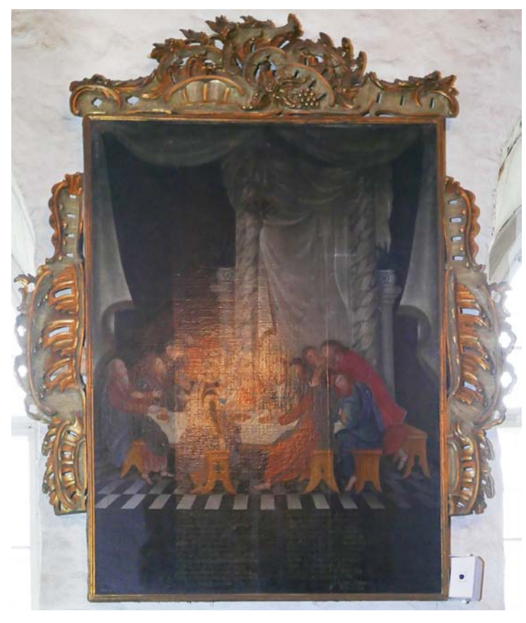
Fig. 7 a-b. Hobøl Church in Østfold. To the left (p. 50): the shadow painting behind today's altarpiece. To the right: the altarpiece from 1761 with rococo wings mounted upside down.

two evangelist figures at the top of the object are not seen in the shadow painting (fig. 1).