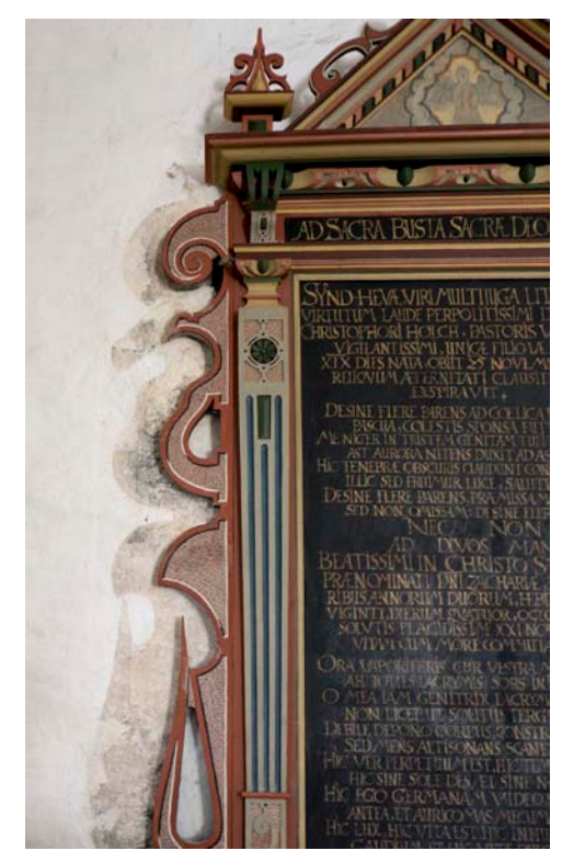
Fig. 5. Veøy Church in Møre og Romsdal. The shadow decor surrounding an epitaph from 1623.

Most of the preserved shadow paintings in Norway were painted on whitewashed walls. However, there are also examples of shadow paintings that were painted on top of existing wall paintings. In Dale Church, for instance, a shadow painting