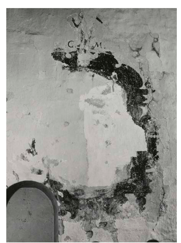
Fig. 2. Shadow painting in Ringsaker Church during uncovering in 1959.

and as a result it was crucial for this study to identify original and secondary paint.<sup>15</sup> During the nineteenth century, nearly all of the Norwegian wall paintings, including shadow paintings, were whitewashed or painted over with white paint. It was not until the early twentieth century that older wall paintings were rediscovered and successively uncovered. Often, only fragments of shadow paintings were preserved, and in some cases, new shadows were creatively painted based on traces of black paint found on the wall.<sup>16</sup> In other cases, enough original paint was found to