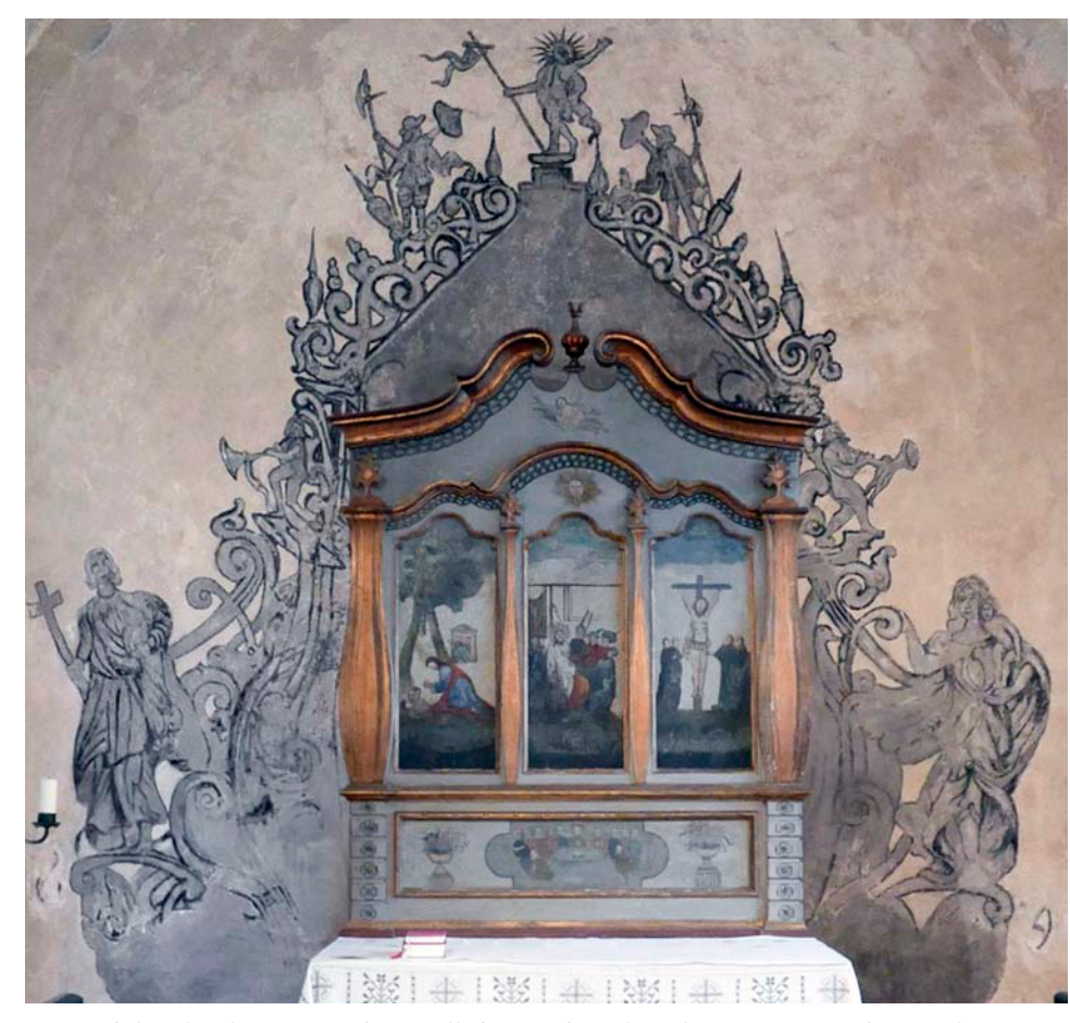
Fig. 3. Efteløt Church in Buskerud. Grisaille framing from the 17th century surrounding an altarpiece (1787) from Komnes church. The original altarpiece once belonging to the grisailles in Efteløt are today lost.

Framings in grisaille are, like shadow paintings, painted around an object and have often been misinterpreted as shad-