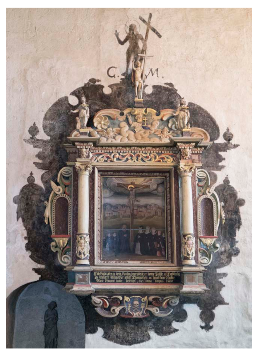
Fig. 1. Ringsaker Church in Hedmark. Shadow painting surrounding an epitaph from 1632.