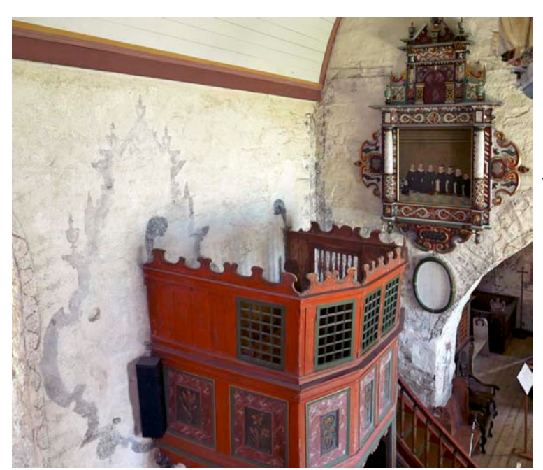
Fig. 4. Dale Church in Luster, Sogn og Fjordane. The abandoned shadow painting on the north wall (left in the photo) belongs to the epitaph from 1630, hanging on the north side of the chancel-screen (top right on the photo).