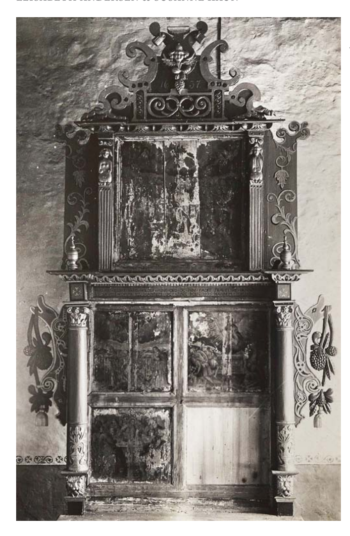
Fig. 8 a-b. Hof Church in Vestfold. The altarpiece before the restoration in the 1940s (to the left) and the altarpiece in 2018 (to the right, p. 53). The shadow painting nearly disappears behind the altarpiece.

conclusion that the shadow does not belong to the existing altarpiece, but most likely was painted together with another altarpiece dating from 1761, which today is mounted in the nave. Comparing the shadow with the altarpiece from 1761, one can see that the carved rococo wings have been changed at some point. An archival photo