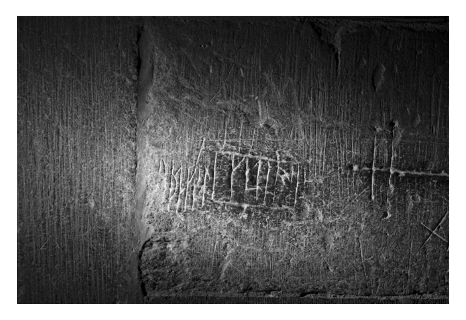
Fig. 4: "Guð taki sál Ketils." (May God take Ketill's soul.) The inscription was carved in two stages. First, Ketill's name was carved and given a frame. Later, someone added a prayer to the name. Photo by the author November 28, 2017.

is not valid. Here, the carvers cannot be said to express a religious or social self through their inscriptions. <sup>18</sup>