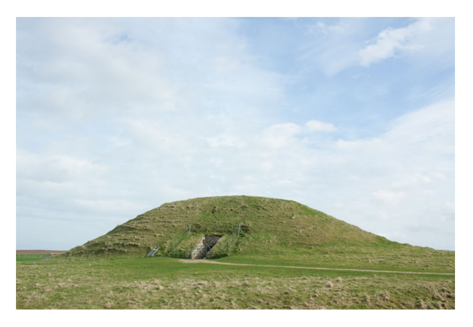
Fig. 1: Maeshowe is a Neolithic chambered cairn situated at Mainland, Orkney, which is filled with medieval runic graffiti. Photo by the author April 19, 2018.

the largest corpus of non-ecclesiastical runic graffiti. As such, it also gives us insight into a non-ecclesiastical medieval social setting.