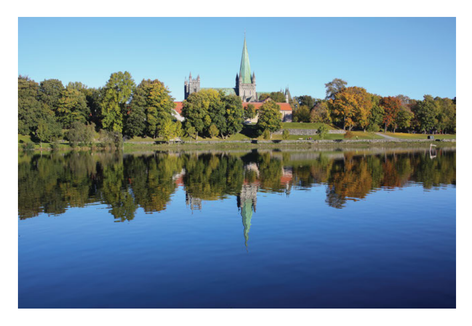
Fig. 2: Nidaros Cathedral is in Trondheim, Norway, and its walls are filled with both medieval and post-medieval graffiti inscriptions. October 15, 2016.

the carvers seem preoccupied with the mound itself and the treasures it might once have hidden. The Maeshowe carvers also carve inscriptions about sex and their own rune-carving skills. Both of these inscription types are known from other runic corpora as well (particularly the rune stick material), but they are less common in churches. Therefore, we see that while some types of graffiti (name and agent inscriptions) overlap and appear both in ecclesiastical and non-ecclesiastical environments, other types are either predominantly ecclesiastical or non-ecclesiastical.