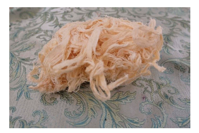
Figure 2. The Birch fibres used as a diaper inside of a traditional Nenets baby's cradle.

Area (YaNAO) and in Tajmyr Dolgan-Nenets District (Figure 1). In the studied regions, in Jamalkij Rajon, 12,387 Nenets live on the tundra within a nomadic culture and community [6,p.7], in the YaNAO in total 14,600 thousand people, or about 40% of the population are indigenous people leading a nomadic lifestyle [7]. In the NAO, according to the local Government, 840 Nenets reindeer people are living in the Tundra [8], but, according to the data provided by the Union of Reindeer Herders of the NAO (unpublished), the number is actually much higher – according to their calculations, up to 2500 Nenets are involved in reindeer husbandry on a daily basis. These Tundra reindeer herders are constantly moving between 500 and 1800 km per year: during the wintertime they are in forest areas and in the summertime they are on the coast of the Polar Ocean. The reindeer herds are migrating over mighty rivers such as the Ob in the YaNAO and the Pechora in the NAO twice a year, when the rivers are covered with ice during the early spring and late autumn (see map).