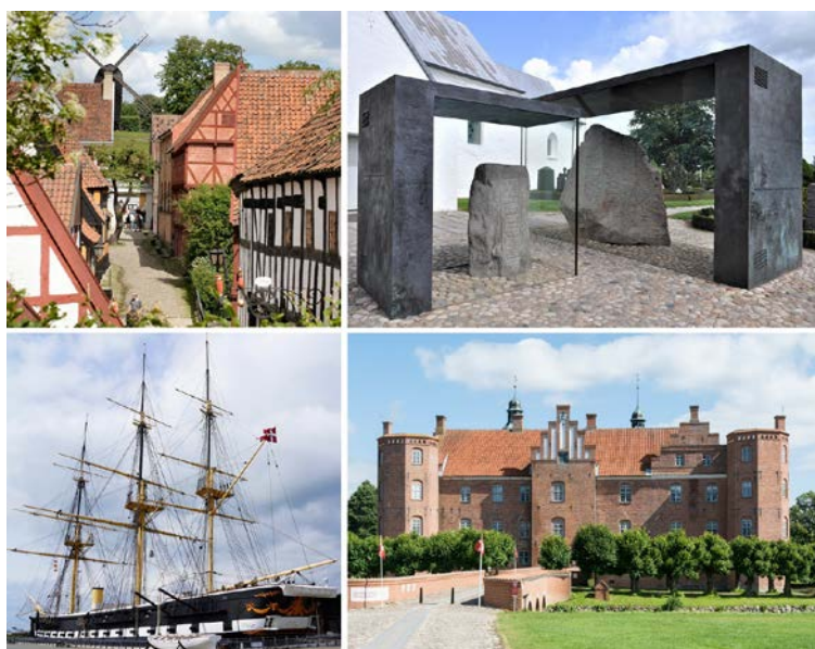
Figure 2: Heritage sites promoted by DPP. Top left: Den Gamle By living history museum (photo, Villy Fink Isaksen CC-BY-4.0) Top right: The 10th century Jelling stones (photo, Ajepbah CC-BY-3.0). Bottom left: The museum ship Jylland (photo, Sebastian Nils CC-BY-3.0). Bottom right: Gammel Estrup manor museum (photo, Ajepbah CC-BY-3.0). Sources: https://goo.gl/wim3WL ; https://goo.gl/B3GRgg ; https://goo.gl/na17Rd ; https://goo.gl/EjZboe (accessed 17 December 2017).