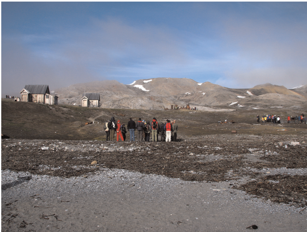
Fig. 4 London, in Kongsfjorden, is a fascinating site with remains from a rather unsuccessful and short-lived history of marble quarrying. The site has experienced increased visitor numbers during the last decade, and part of the site is very vulnerable to human traffic.