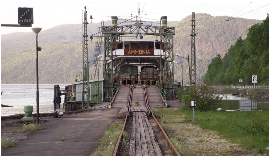
Fig. 3. The ferry "Ammonia" (1929, protected 2009) is an important link between Notodden and Rjukan, two neighboring industrial towns based on easy available hydroelectric resources. They were assigned status as World Heritage Sites in 2015.

designated as European simply because they are located there. According to Soyez, it is essential to bring forward a broader perspective on transnational issues (Soyez 2009, p. 49). His main criticism, however, concerns the way the industrial heritage is presented: The dark sides of European industrialisation processes are seldom properly represented, which result in industrial heritage being pictured as 'sanitized heritage'. The point he particularly calls attention to is the role that industrial enterprises have played during wars. There is no focus on the 'disquieting realities of war and occupation or the ordeals of prisoners of war or forced labour'. According to Soyez, there is an abundance of industrial sites that will evoke dark memories across Europe. He uses this as an illustration of the dissonance that much heritage holds. In his article, Soyez identifies alternative ways of thinking about and representing industry in the heritage field (Soyez 2009, p. 44).