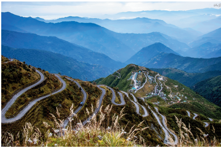
Fig. 2. A section of the Silk Road: steep, curved stretches of road in Zuluk, Sikkim on the Silk Route from India to China (photo: Soumya N. Ghosh. Used with permission).

or excluded from the inscription. As well as these variations, there are changes to the routes over the centuries and also seasonal differences in routes due to river swells and other climatic phenomena (Williams 2012). This has led to a network of roads that fluctuate in their usage. Consequently, there is not necessarily always a single defining route that can be used to represent the site.