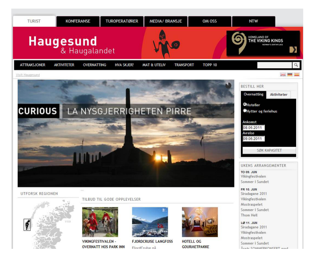
Figure 3. The 'Harald silhouette' on the website Visit Haugesund (http://www.visithaugesund.no).

Homeland of the Viking Kings", and as expressed in similar terms at the website Visit Haugesund (Visit Haugesund 2013), the land 'Haugalandet' has become synonymous with a commercial region with numerous tourist attractions. The modern myth of Harald Fairhair constitutes a central part in this regional imagery (Figure 3). The regional image of 'Haugalandet', the Land of Mounds, is first and almost defined by a heritage where a homeland myth based on Harald Fairhair—the land of Kings—is synonymous with a Viking heritage. In a Norwegian context, other Viking regions compete in being similar commercialised regions. It is a regional romanticism that applies to late modern experience society within the scope of the heritage industry and which is based on popular uses of the Viking concept in general and Harald Fairhair in particular.