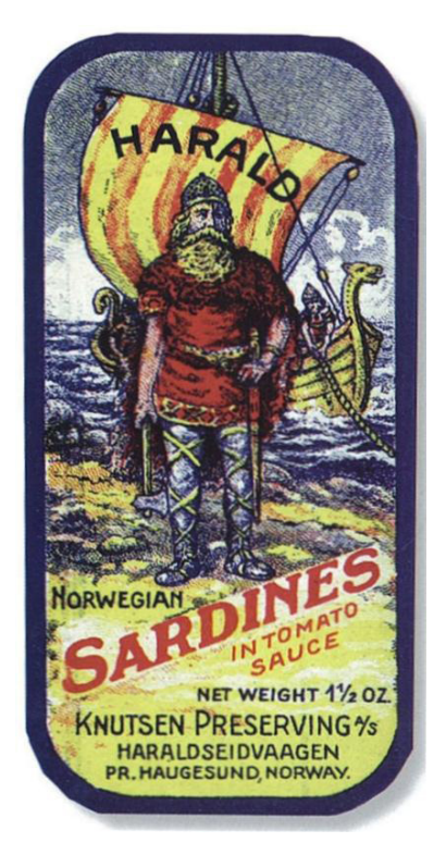
Figure 2. Harald Fairhair used as advertising for sardines from Haugesund (after Bjørnson 2004: 196).

cigars', stoneware with engravings of the Harald monument, and Harald amulets (Østensjø 1958: 297, 303-304). Commercial uses of the past were, in other words, the main motivation for the local community, and here national politics became instrumental tools for gaining attention and to attract a visitor and buyer market. The local patriotic goal was to put Haugesund on the world map. As such, the idea of the past as commodity was a vital driving force for a local memorial practice based on King Harald Fairhair. In the 1870s, Haugesund was a new 'Klondike-town' that had grown out of the boom caused by lucrative fishery exports, among others to England. Harald Fairhair could as a brand promote their position in the market. This is also evident during the twentieth century where the Viking hero Harald Fairhair was branded in several ways: as slogans for sardines, milk, soda pops, and other products (Figure 2). The positive character associated with Harald Fairhair representing braveness, strength, healthy climate, etc. —defined a vast consumer culture.