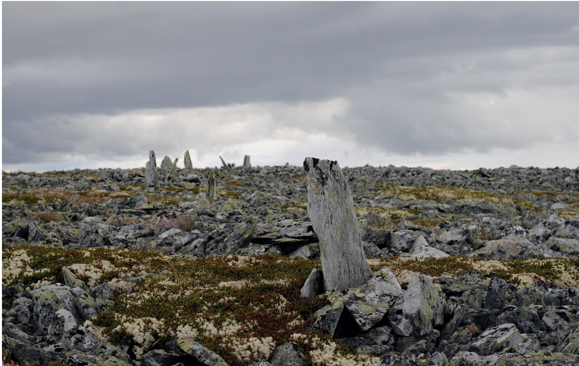
Figure 1.5: Part of the funnel shaped reindeer trapping system at Storhøa – Buhøgda, Engerdal. The raised stones are visible remains of one of the many fences.

This huge system consists of multiple fences, several kilometres long. The fences are made of upright stones, small cairns, and possible postholes, and several hunting-blinds and meat stores are connected to the system (Figure 1.5). No enclosures have been found, but it is possible that the fences would have terminated in enclosures built with wooden stakes. The system was previously mapped by E. Barth and S. Barth, who also found a possible burial mound in the valley of Tuvflået (Barth and Barth 1981: 268). Mapping of additional elements of the system by the archaeologist Kjetil Skare of Hedmark County in recent years, as well as the authors' own observations in 2013, shows a more extensive and complex construction than that surveyed by Barth (Skare, pers. comm. 2019).