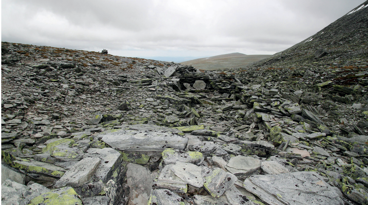
Figure 1.2: The large enclosure in Gravskaret. The two small pits are located close by, one of them is seen in the foreground.

The system in Gravskaret is relatively small, but complex (Figures 1.2 and 1.3). At the top of the hill, two small pitfalls approximately 12 m apart are located that were made to catch one reindeer at