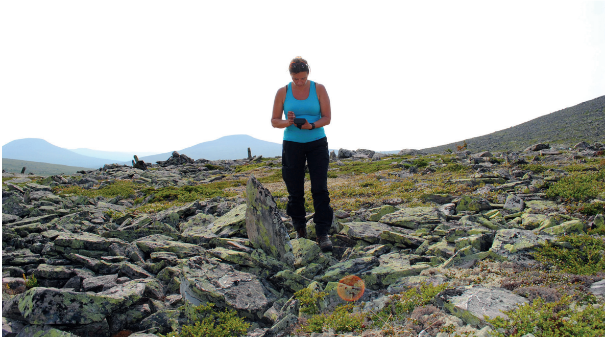
Figure 1.4: Mapping of the funnel shaped reindeer trapping system in Vesle Sølensskaret.

In Rendalen valley, several varied objects of Saami origin were found. Although there is some geographical distance from the hunting systems in the mountains, a likely cultural-historical connection is possible. At the farm of Unset, a remarkable silver hoard from the Viking Age was found consisting of two buckles and a large necklace (Bergstøl 2008: 97, 103–104). Silver hoards of this type are known in northern Norway, often located in border areas between Norse and Saami settlements (Zachrisson 1984; Hansen and Olsen 2004; Spangen 2010). Moreover, at the farm Fonnås in Elvål there are several additional finds, the most famous object is a Norse relief brooch, the so-called ‘Fonnås-spenna’, dated to the Migration period. Among other objects of Norse character from the Viking Age is an arrowhead of the so-called ‘Wegraeus’ type B’ (Wegraeus 1971). These arrowheads occur in Saami sacrificial finds and were found in a burial context at the Saami settlement of Vivallen in Härjedalen in Sweden (Zachrisson 1997: 68–69; Bergstøl 2008: 97). Moreover, at Elvål a Finnish-Ugric bronze jewellery piece, shaped like an animal figure, was found together with a long bronze chain. This type of jewellery is often associated with Saami religious practices and to settlement sites (Gjerde 2010, 2016).