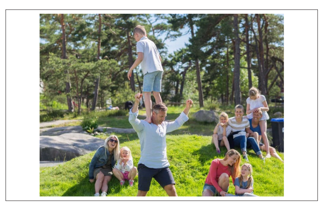
Figure 2. Suburban leisure class.

Many of the same traits that are found in Figure 1 apply to the second image (Figure 2). The background is decontextualized and could be almost anywhere in suburban Norway. The color saturation is below the naturalistic standard, which creates a slightly dreamy atmosphere. However, in contrast to the previous image, there is no one looking directly at the viewer; hence, no eye contact is established, which makes it an offer picture. The viewer is able to look at the scene as an observer who is not called on for a response and can thus associate with the theme rather than the individual (Machin, 2007, p. 112). The scene is composed of three family groups. Most of the participants are looking toward what is foregrounded in the middle of the image: a healthy man with a young boy on his shoulders. The sitting groups are looking toward the man and boy, who display their strength and balance. Vertical angles are associated with power. If you look "up" to someone, that means that he or she is in a stronger position than you are; conversely, if the angle is lowered, the social relationship changes, and the person of focus becomes more vulnerable or even inferior to the onlooker (Machin, 2007). The image here implies that the females are taking care of their children, while the male virtues are presented.