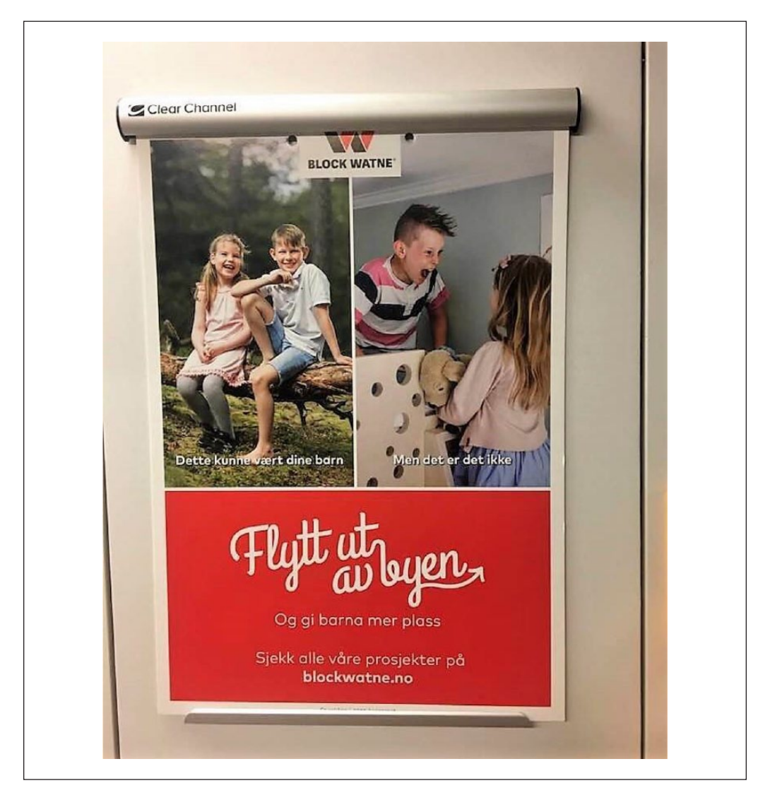
Figure 3. A child-friendly suburbia contrasted to a cramped (urban) nursery.

"new" is placed to the right. This is something that is not yet known and thus requires special attention from the viewer. The new may be contestable, whereas the given is presented as componential and self-evident (Kress, 2010), although this does not apply to all images. Anthropologists have notably found left–right symbolism in most cultures. In Western societies, we write from left to right, and in speech, we begin with that we assume is already known before we proceed to the information that we wish to impart (Machin, 2007). Therefore, what is peculiar about this image is that this composition is reversed. The urbanities—the target group—view two kids, a boy and a girl, sitting on a fallen tree in the woods smiling toward the viewer. Both have established eye contact with the viewer, making it a demand image. The "real" section states, "This could have been your kids." What we are witnessing is not the given, or what we take for granted, but rather what we can achieve if we move out of the city. If we get lost in the dream and move on to the right side of the picture, reality hits. The text in the "real" section says, "But it's not." What we see is not a new, untroubled life in suburbia but rather our present life. The reversal of