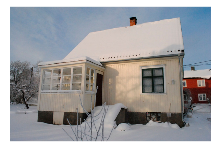
Figure 1. Villa Dammen, Moss, was with its steep saddle pitched roof and classical proportions constructed in a slightly obsolete style. The glass veranda is not heated.

Dammen make use of temperature zoning during heating season as well as reducing the set temperature of the building when they are not at home. Such measures are not considered standard in energy consumption simulations. Consequently, actual measured energy consumption in Villa Dammen over the two years after refurbishment is significantly lower than the estimated energy consumption from Simien simulations which were used as the basis for the LCA. Scenarios, where actual measured energy use was used, were, therefore, also investigated in the study as an additional scenario.